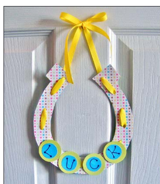
GOOD LUCK HORSESHOE