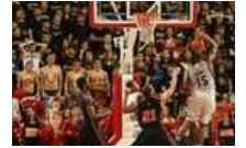
Rutgers vs. Seton Hall Basketball