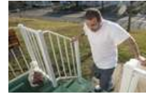
Woodbridge Man Beat by Police for Parking Ticket