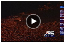
Paramedic In Critical Condition After Falling ... Feb 9, 2012